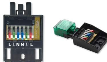
Lever Tool-Free Terminal